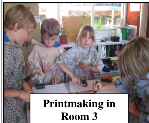
Printmaking in Room 3